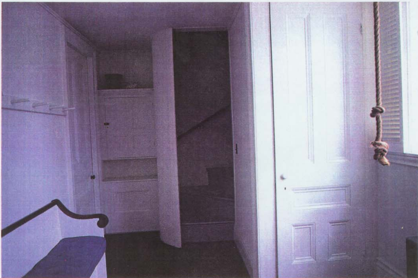
Interior of the First Congregational Church of Blue Hill; built in 1843.