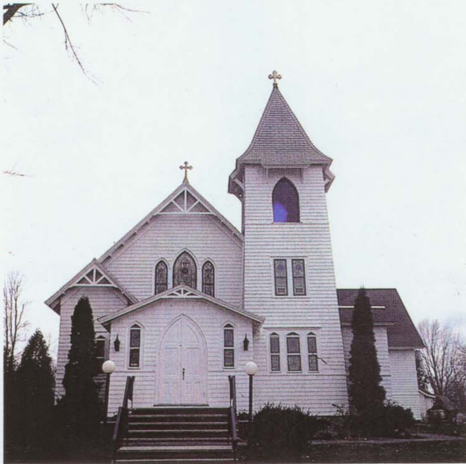
Our Lady of Good Hope, Roman Catholic Church, Camden.