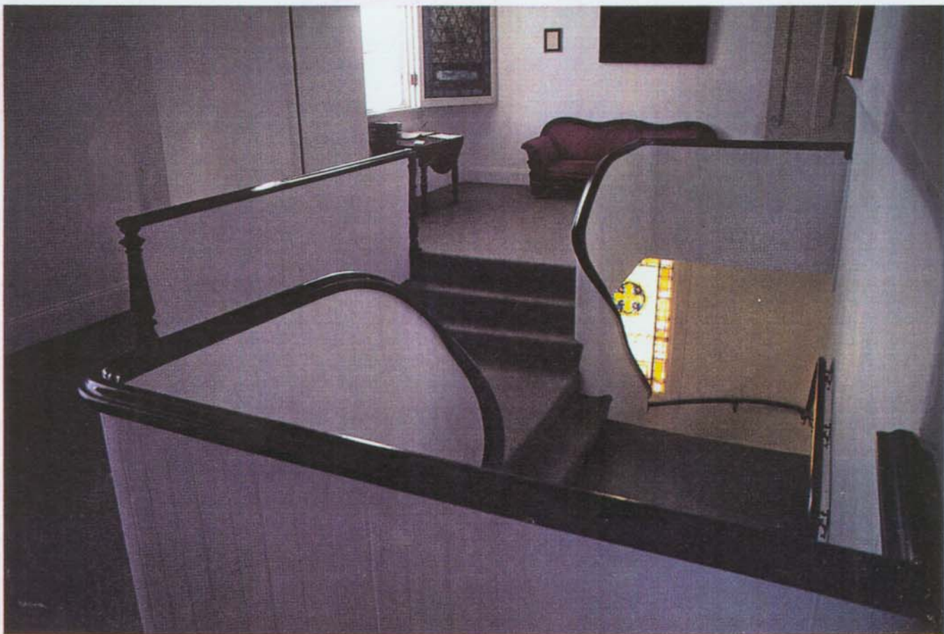
Interior of the South Congregational Church, Kennebunkport.